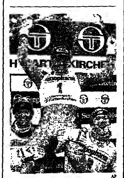
Alberto Tomba of Italy riding high jump Sunday after his World Cup slalom victory, making him No. 2. Page 15.